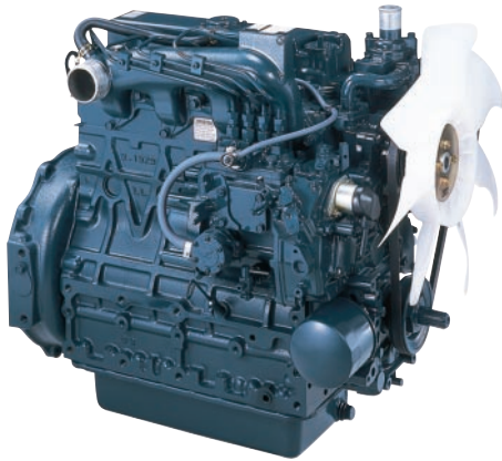
Photograph may show non-standard equipment.