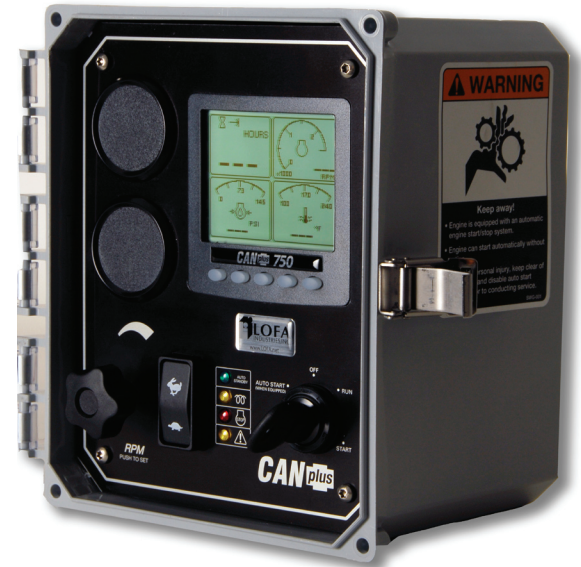
Pictured Above: CP750G2RD

The dual switch inputs can be combined with the transducer input for back-up safety control to protect against transducer clog or failure.