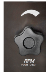
Above: Rotary digital throttle with push-to-set speed selector allows for changes to Auto-start Operate RPM within pre-defined operational limits